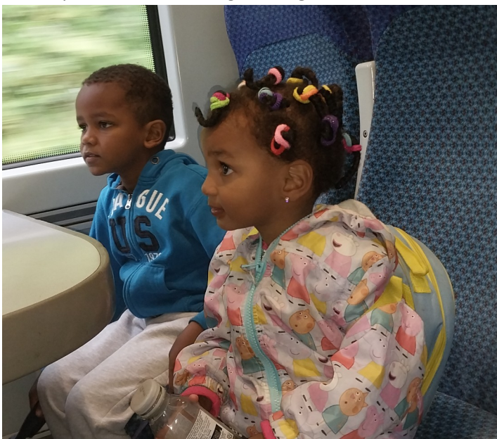
Going for an outing on the train

The rest of the summer will be spent in Belfast, so let us know if you're around and want to meet up. We will be hosting a Senegalese meal at Newtownbreda Presbyterian Church on